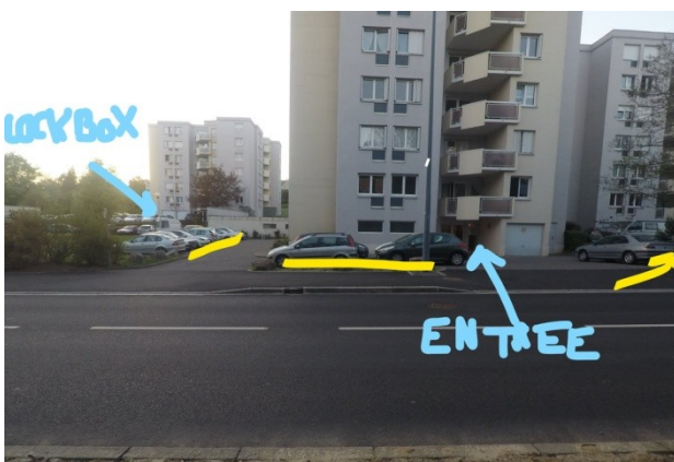
When you are on site, head to the lockbox