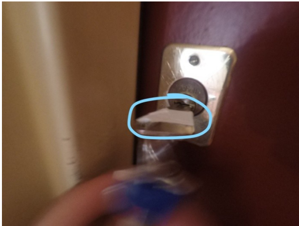
White key = highest lock