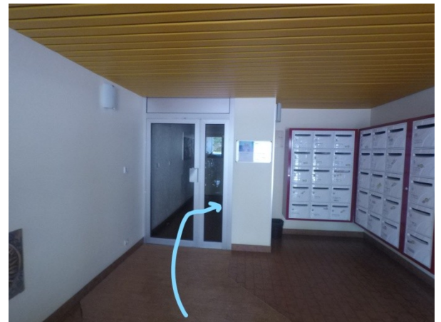
Congratulations, your check in is over! You'll find your keys on the table (building pass + elevator pass)