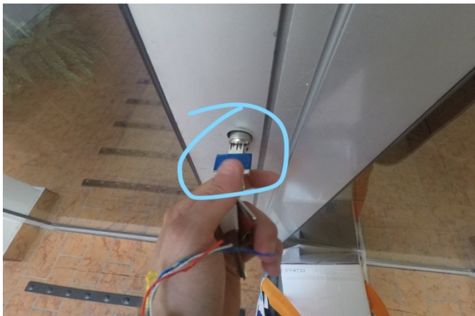
First key to use: the blue one