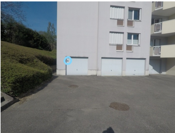
Hanged on the last garage