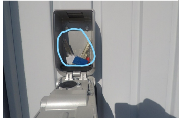
Take the key