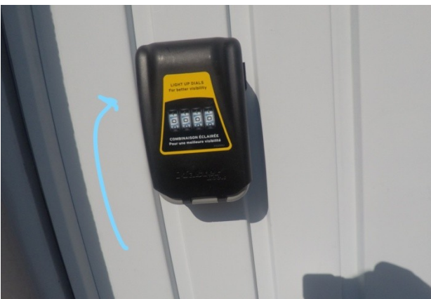
Turn the numbers to hide the combination, close the cover