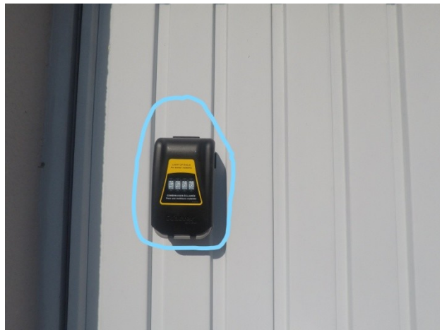
Open the cover and enter the code