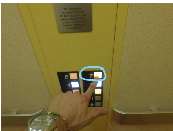
7 e étage