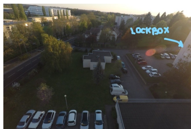
Located 35 th Breitwieser street