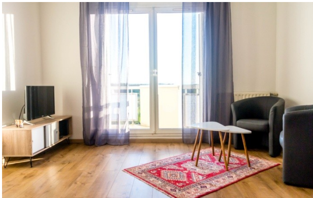
Enter the code