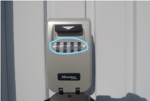
Enter the code