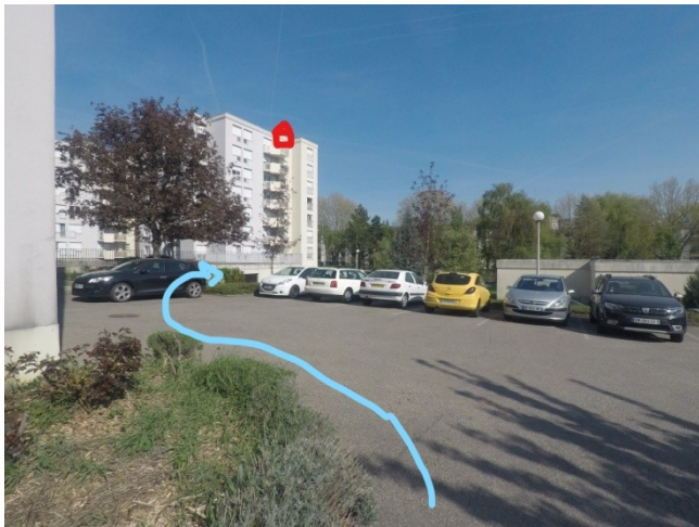
Let's head to the apartment!